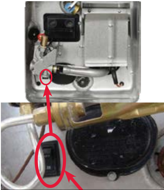
Secondary 110V Switch